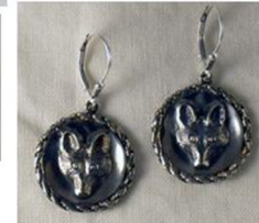
Fox Mask earrings. Posts or lever back drops. Sterling, Bronze. 'Golde' or 14k .3/4 inch with rope edge.