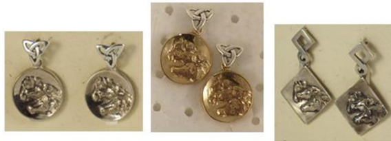
Sterling with Celtic post drops