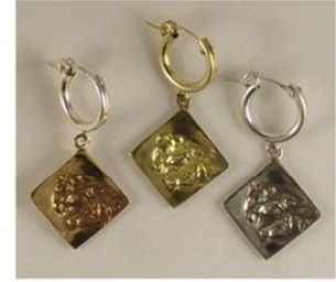
Pharaoh's Horses 1/2 inch square charm drop or post