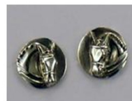
Dressage Horse Earrings, right and left.