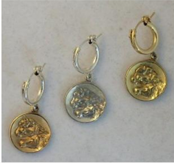
Pharaoh's Horses 1/2 inch round charm drop or post. Sterling, bronze, 'golde' or 14k gold