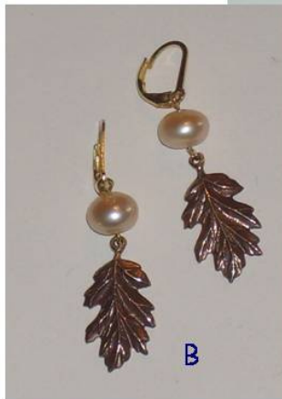
B) Oak Leaf Drop Earrings with peach freshwater pearls. Oak leaves are bronze, 1 inch long x 5 wide. Earring length is 2 inches overall, leverback Style. All findings are gold vermeil over sterling silver.