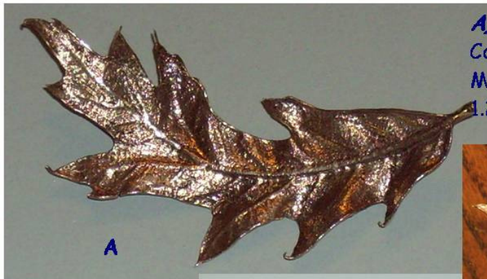
A) Oak Leaf Pin Cast in Bronze Measures 3.5 wide x 1.25 height, satin finish.